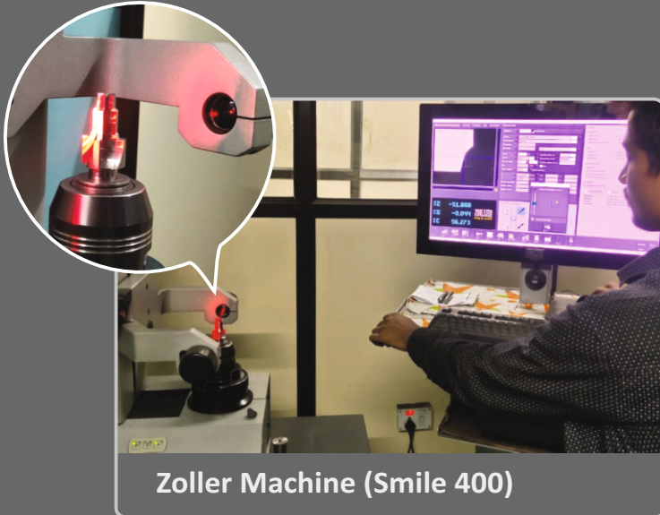
Zoller Machine (Smile 400)