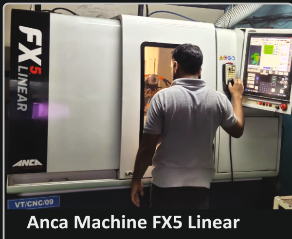
Anca Machine FX5 Linear

Vega Tools has a fleet of world class CNC multi axis tool grinding machine. All Tools are produced in our CNC Machines and Multi-axis Grinding Machines at our Plant ensuring maximum precision and accuracy.