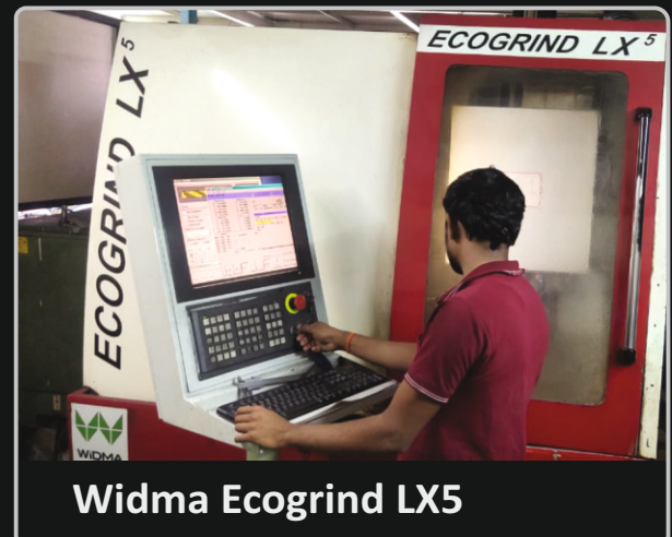
Widma Eco grind LX5